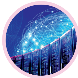
High Availability Servers