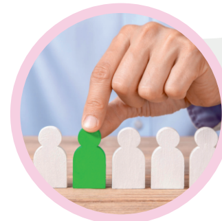
Only What You Need - No fancy features